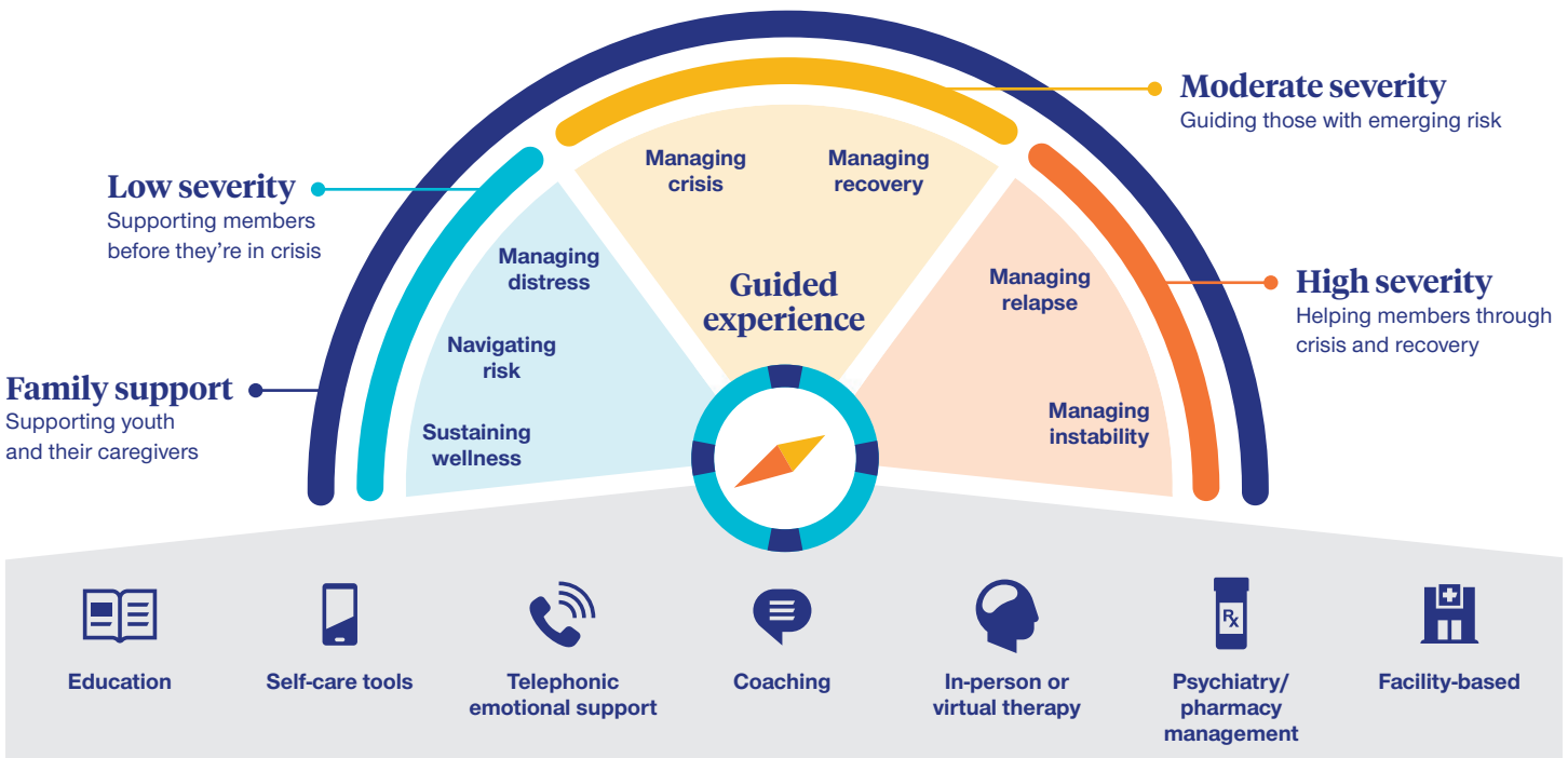
UnitedHealthcare behavioral health care continuum

To build a more robust continuum of care, UnitedHealthcare has evaluated many vendors, bringing in solutions that fill in care gaps, including AbleTo® and Self Care to support identification, proactive outreach and virtual care delivery, and Equip and Genoa Healthcare for data and medication management and specialty behavioral health.